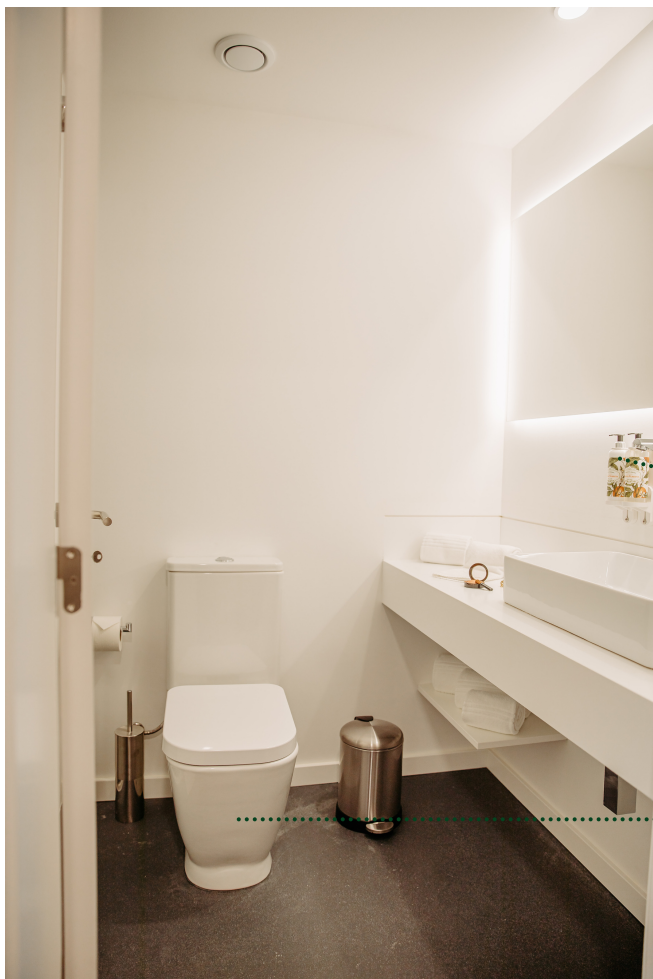
Liquid soap and body lotion