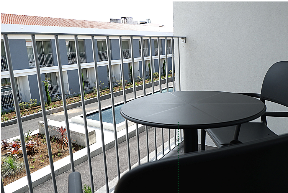
All rooms have a balcony