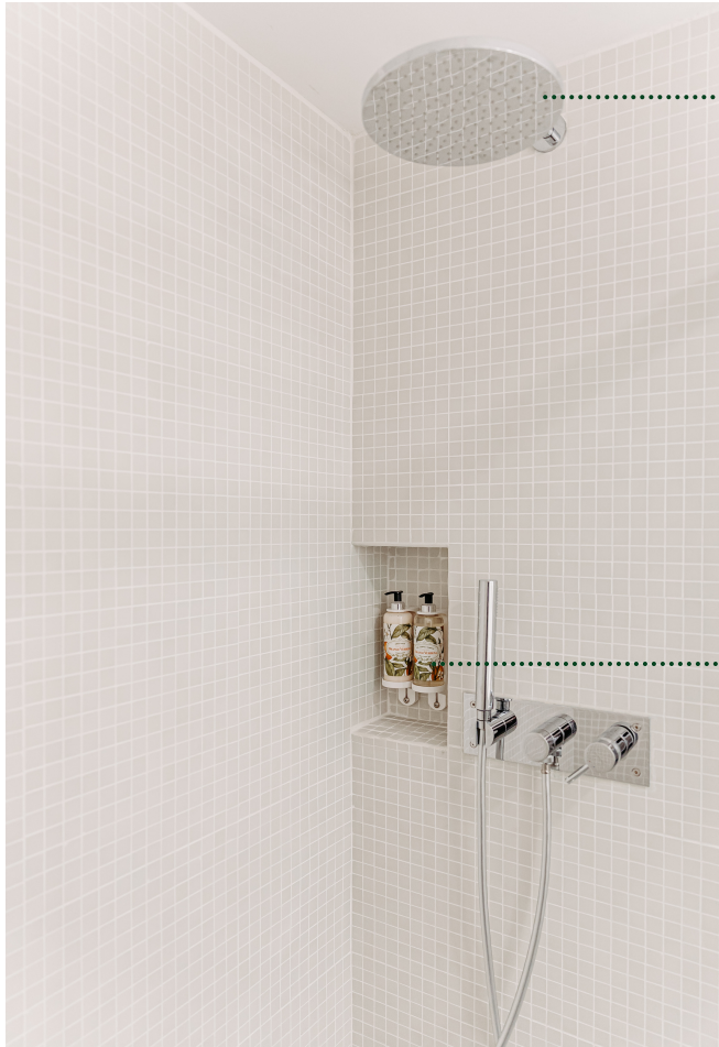
► Walk-in shower